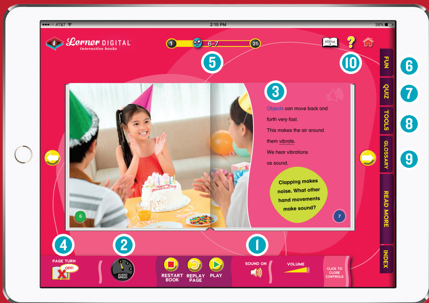
Product shown: Let's Explore Sound from the Bumba Books™ — A First Look at Physical Science series (see page 4).