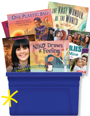
▲ CLASSROOM LIBRARY + BIN