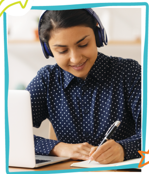
▲ PROFESSIONAL DEVELOPMENT OPPORTUNITIES

Learn and grow to support your students' development