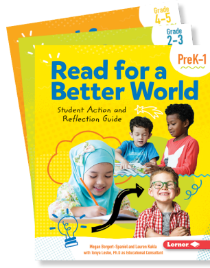
▲ STUDENT ACTION AND REFLECTION GUIDES