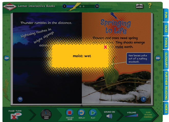
Lerner Interactive Book interactive glossary.

Lerner Interactive Books lend themselves perfectly for teaching vocabulary during any size group or individual lesson. Before you introduce a new title, identify all content area and challenging words by underlining or highlighting them with the pen and highlighter tools. Using the audio feature, click on each word to model the correct pronunciation to present each new vocabulary word to the class. Tell the class the definition of each word by using the built-in glossary (when applicable). Use each vocabulary word in a sentence to clarify and reinforce its meaning. Then ask students to come up with their own sentences using the new vocabulary words. By taking an active part in figuring out the meaning of the word, students have a better chance of retaining the meaning and growing their vocabulary.